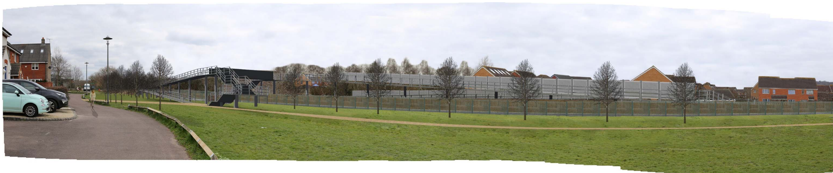
Figure 13: Bridge painted grey with screen on both ramps