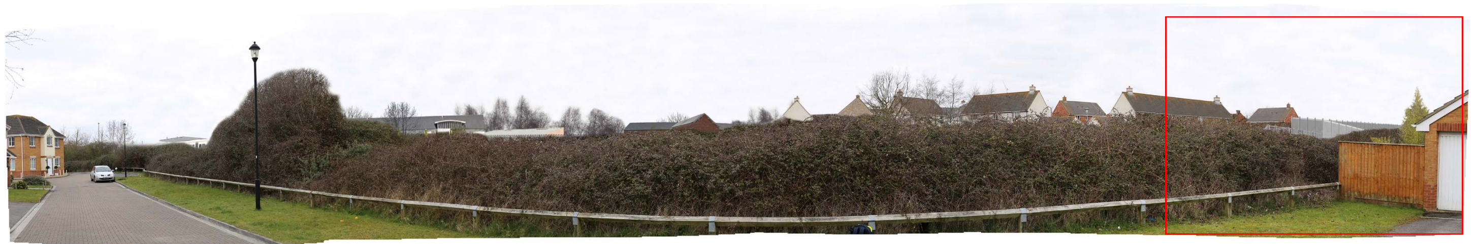
Figure 9: Location of zoomed in view above