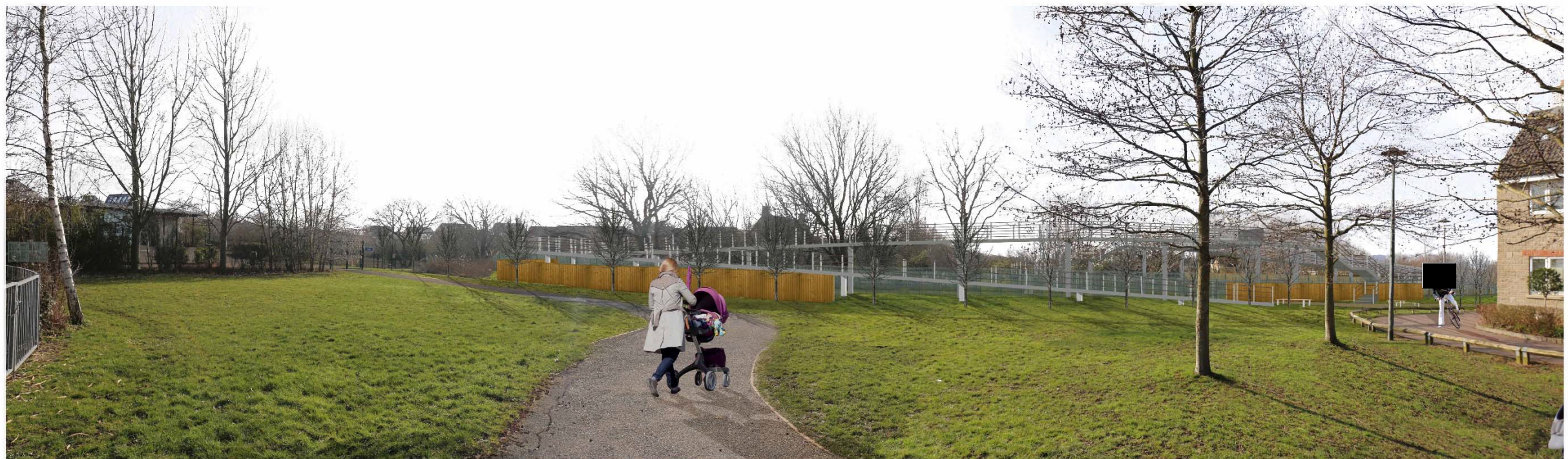
Figure 21: Bridge painted grey with screens on both ramps