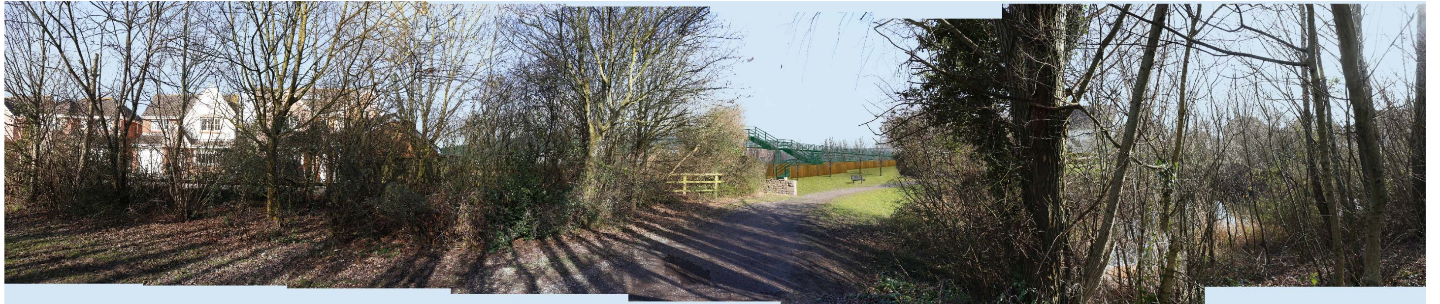
Figure 28: Bridge painted green with screens on both ramps