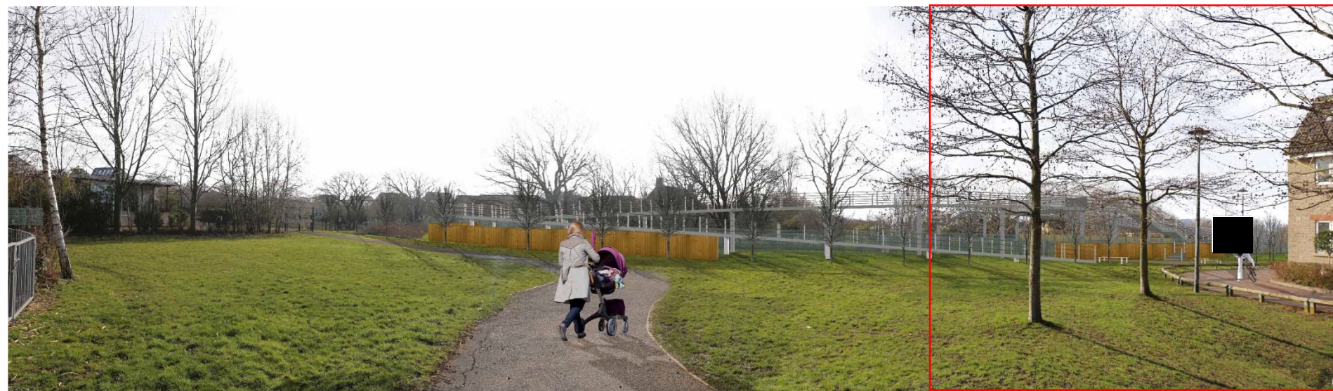
Figure 25: Location of zoomed in view above