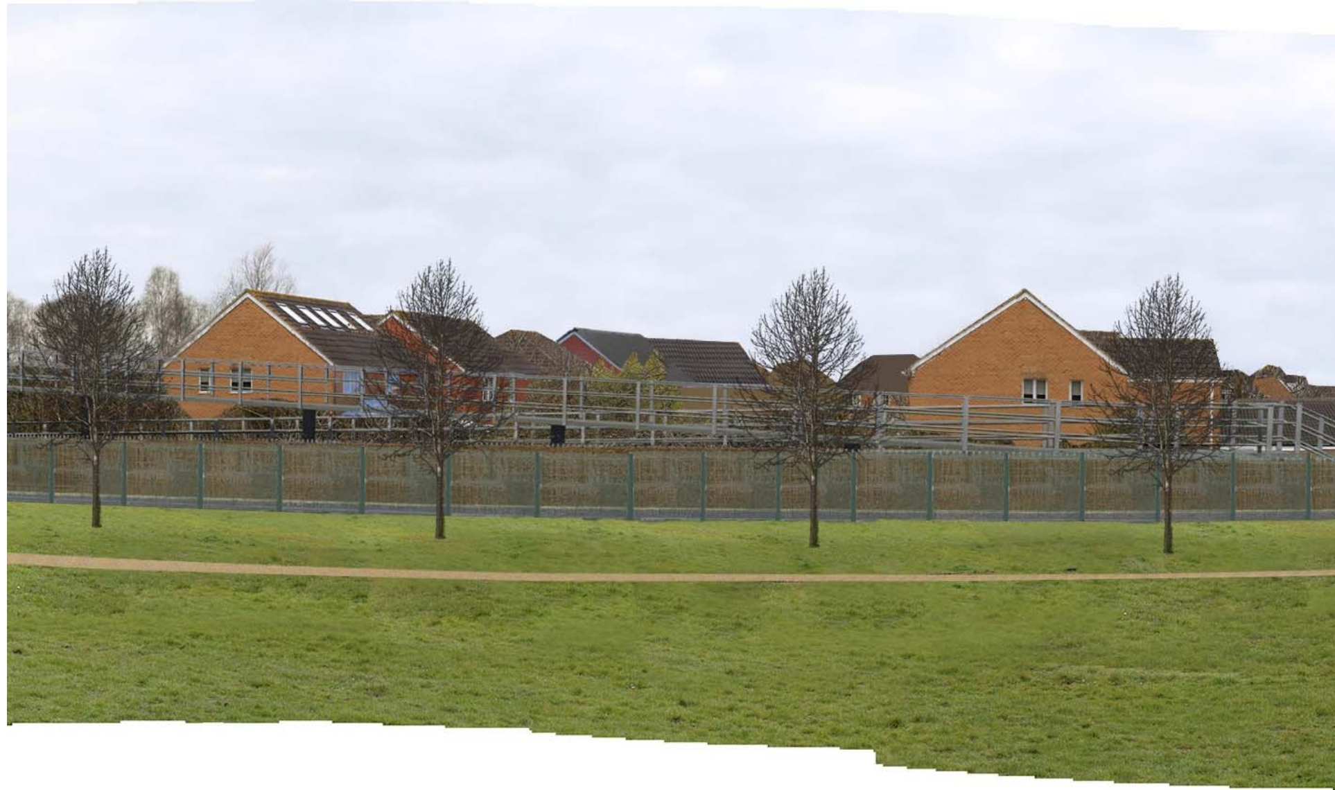
Figure 14: Zoomed in view of bridge in grey without screens on ramps