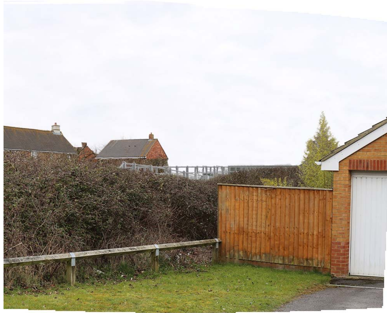
Figure 6: Zoomed in view of the bridge with no screens