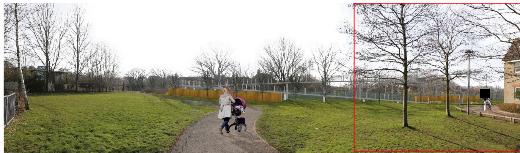
Figure 23: Location of zoomed in view above