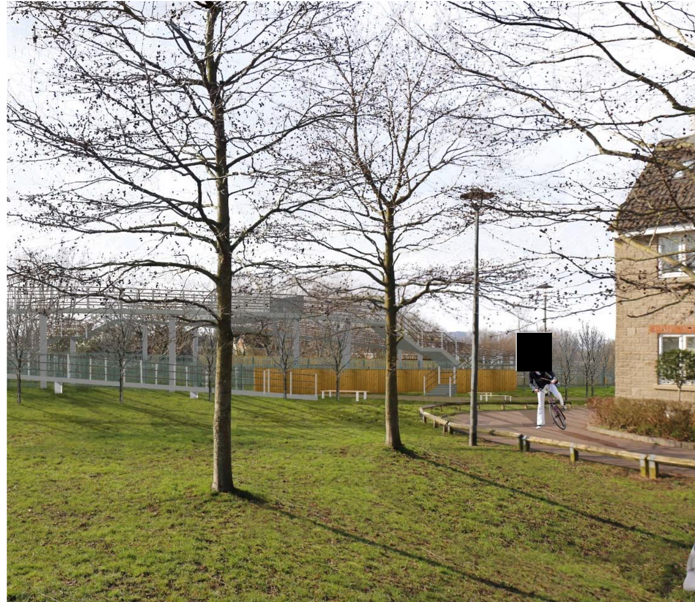
Figure 22: Zoomed in view of bridge in grey without screens