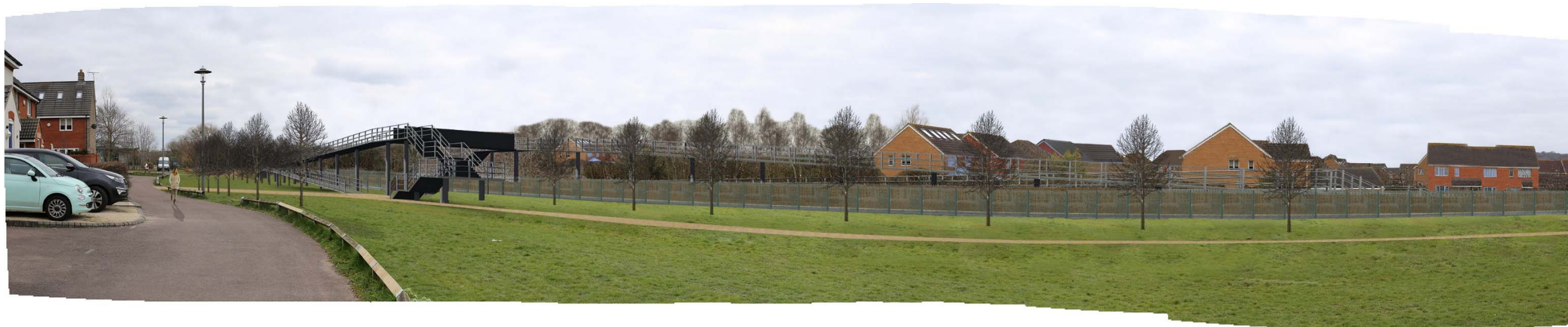
Figure 11: Photomontage 2