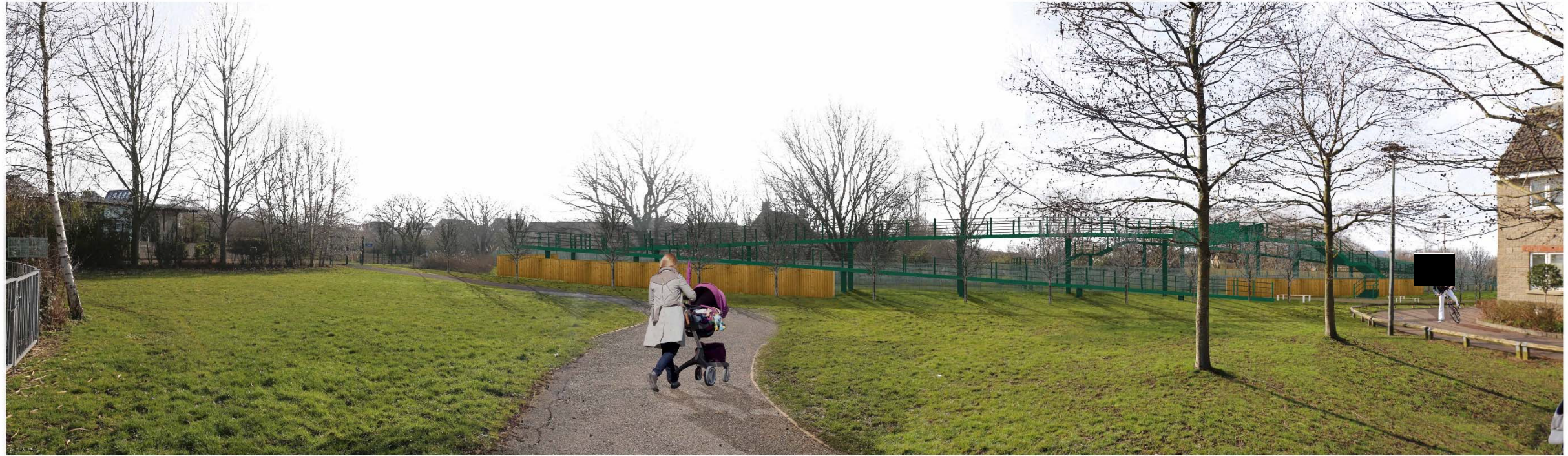
Figure 20: Bridge painted green with screens on both ramps