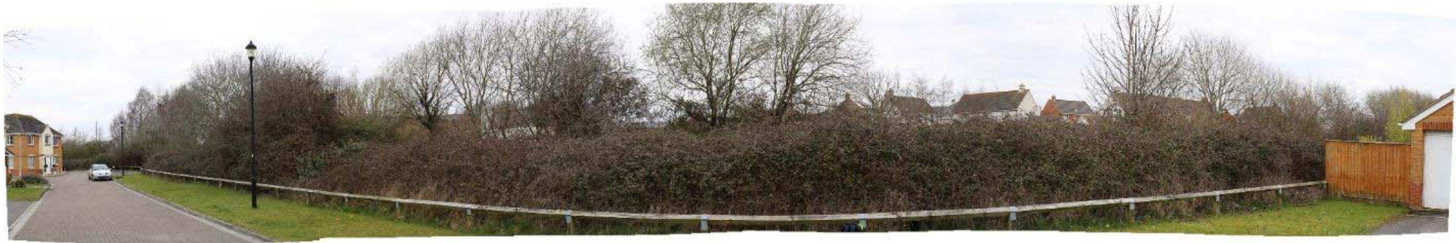
Figure 2: Existing photograph