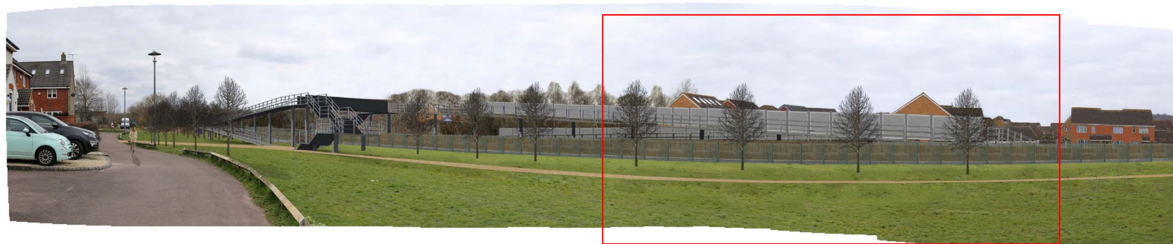
Figure 17: Location of zoomed in view above