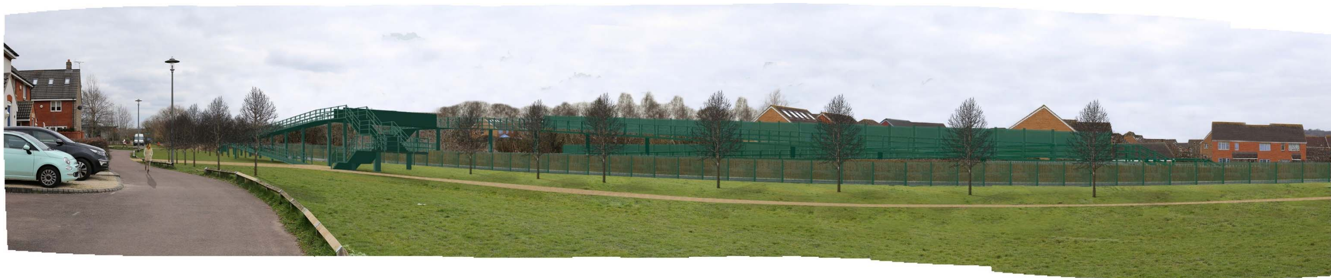
Figure 12: Bridge painted green with screen on both ramps