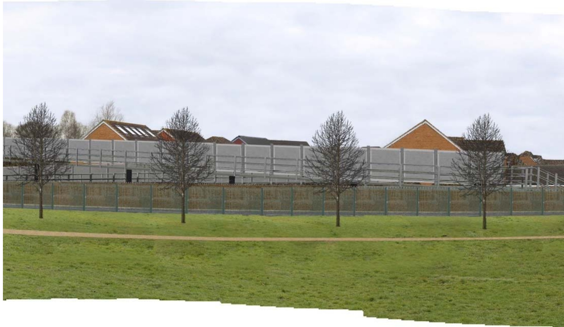
Figure 16: Zoomed in view of bridge in grey with screens on both ramps