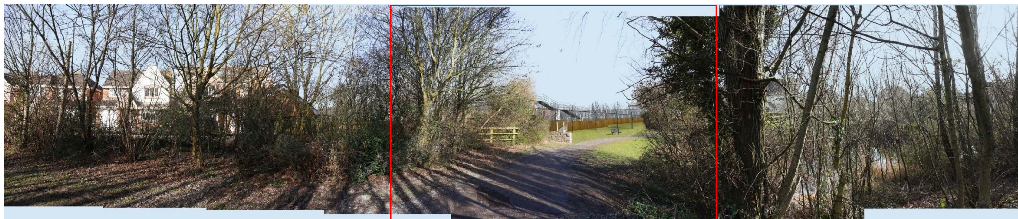
Figure 33: Location of zoomed in view above