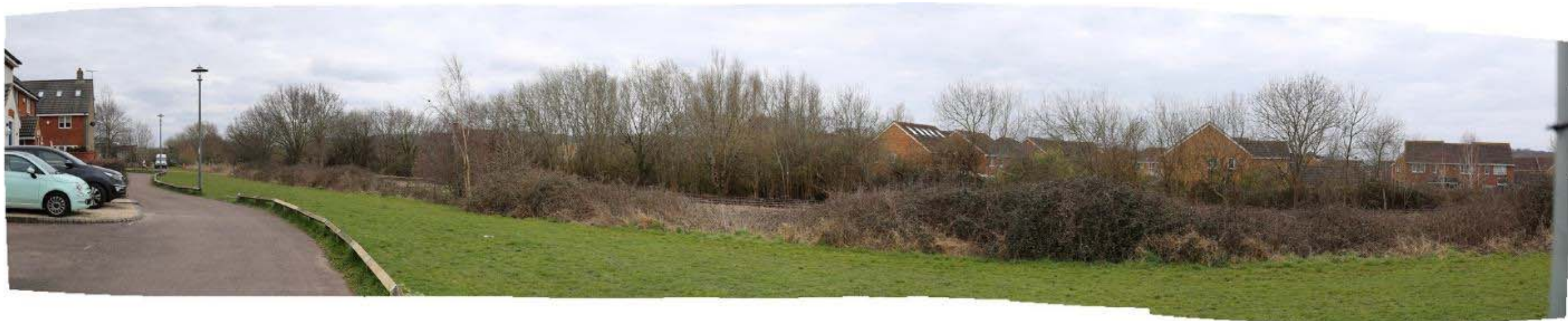
Figure 10: Existing photograph