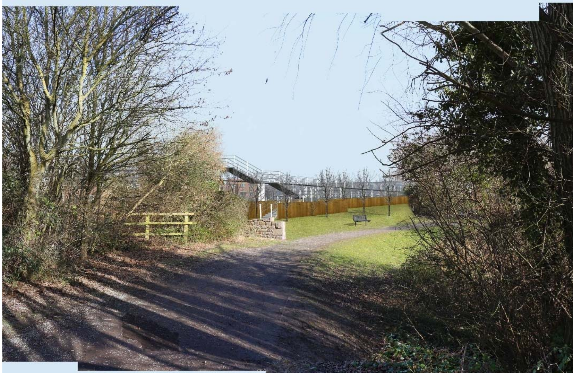
Figure 32: Zoomed in view of bridge in grey with screens zoomed in