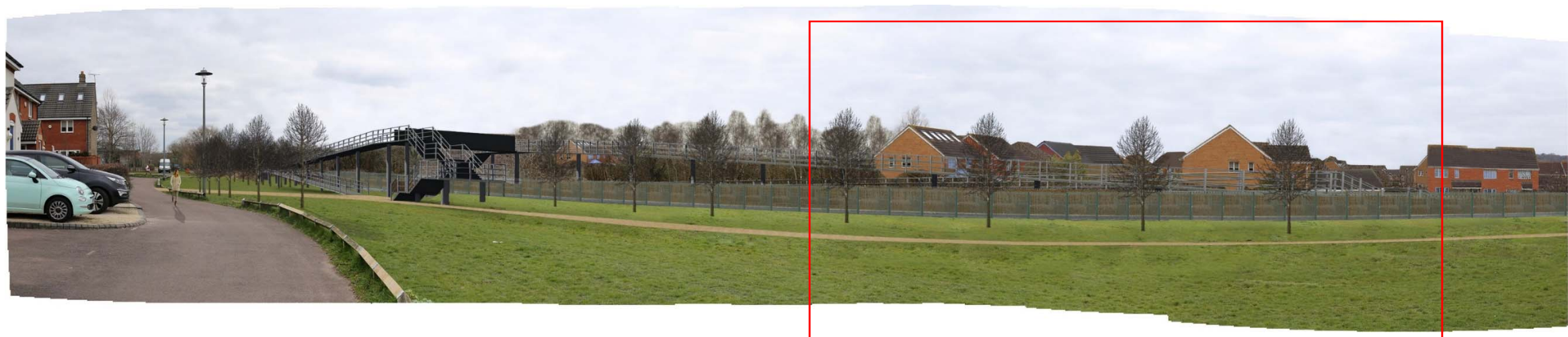
Figure 15: Location of zoomed in view above