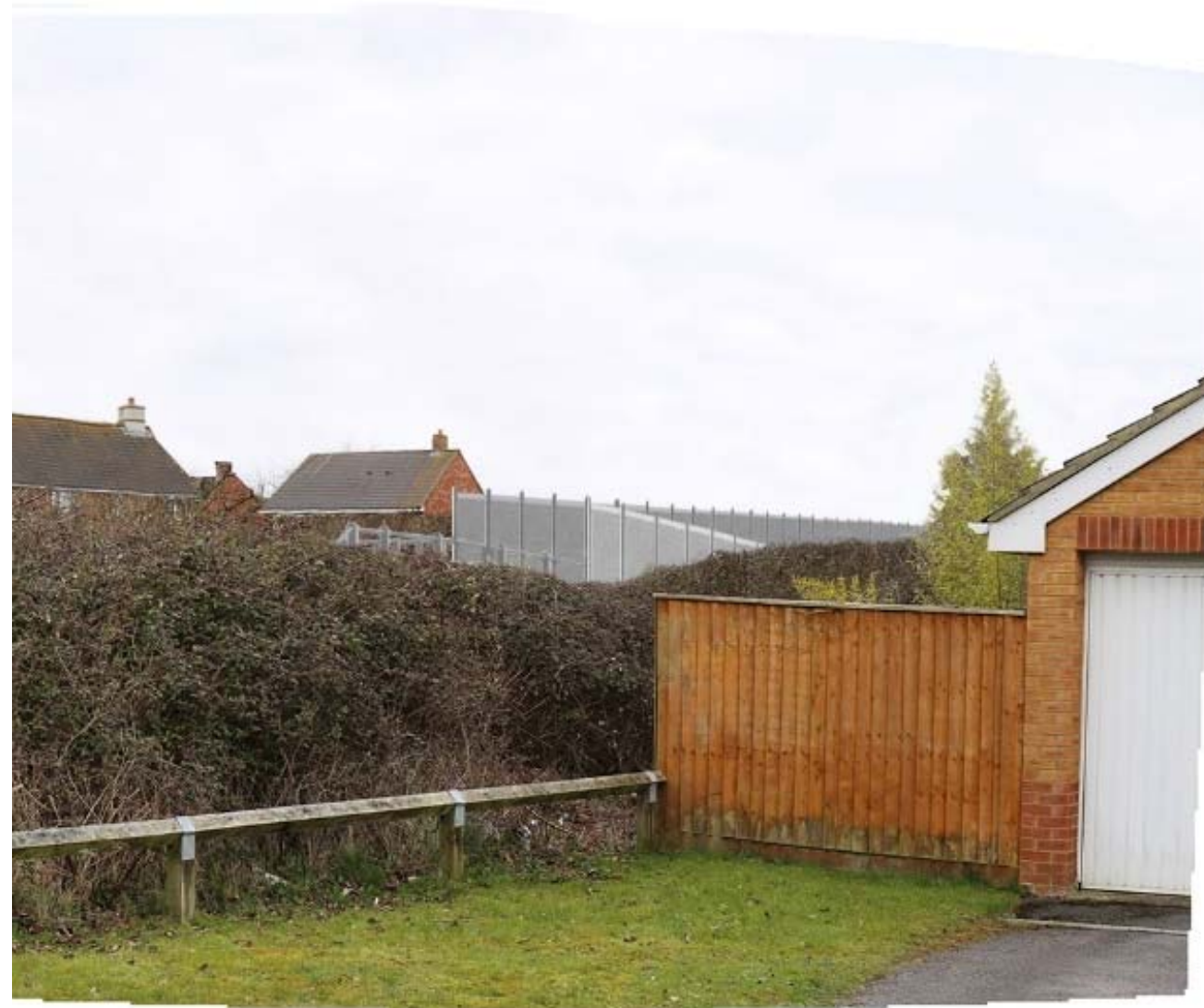
Figure 8: Zoomed in view of proposed bridge in grey with screens on both ramps