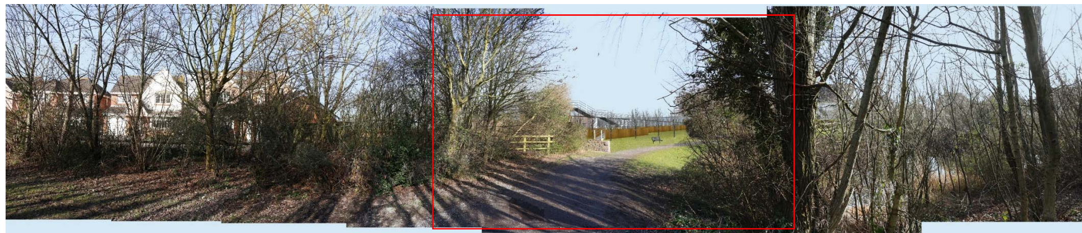
Figure 31: Location of zoomed in view above