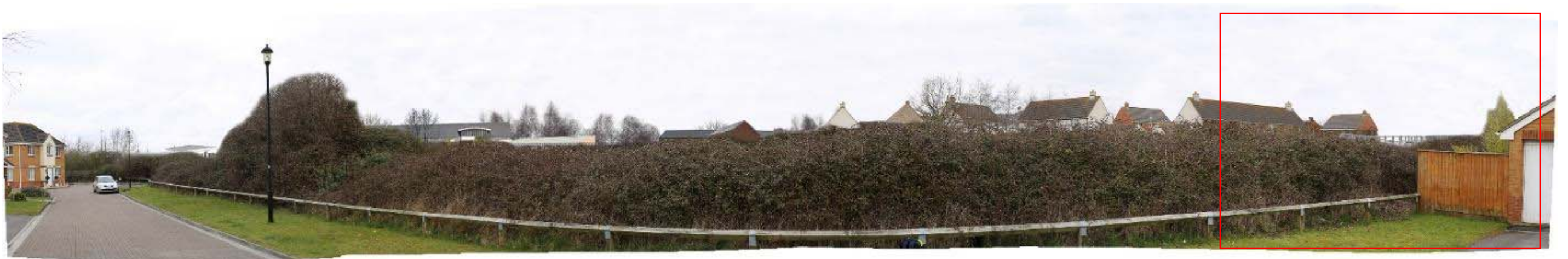
Figure 7: Location of zoomed in view above