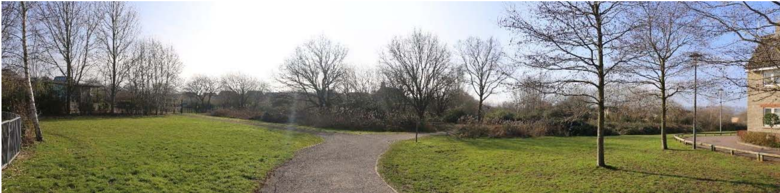
Figure 18: Existing photograph