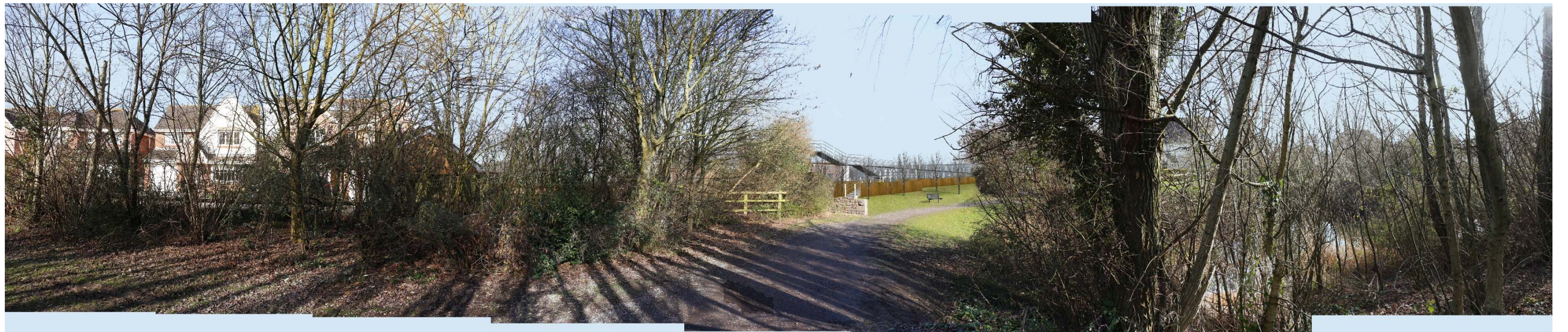
Figure 29: Bridge in grey with screens on both ramps