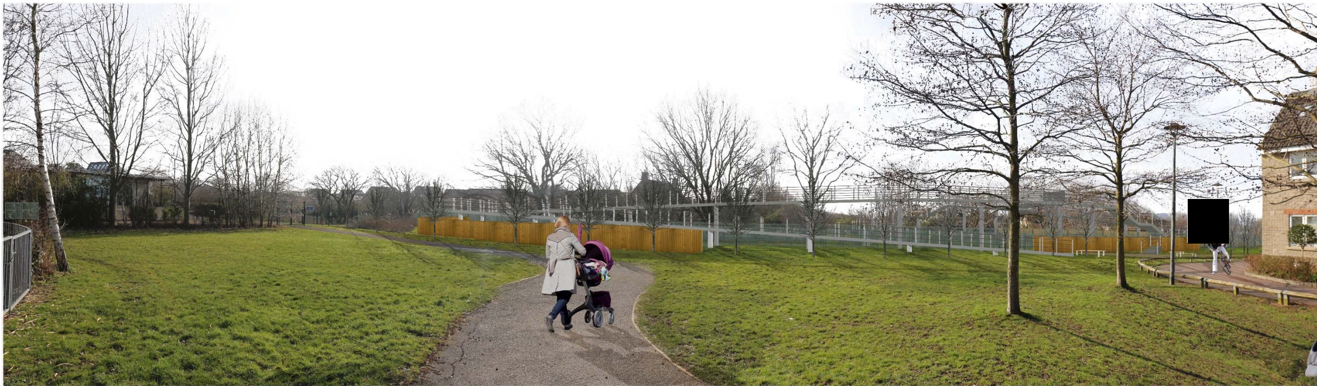
Figure 19: Photomontage 5