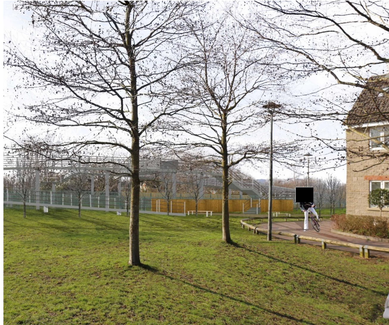
Figure 24: Zoomed in view of bridge in grey with screens on both ramps