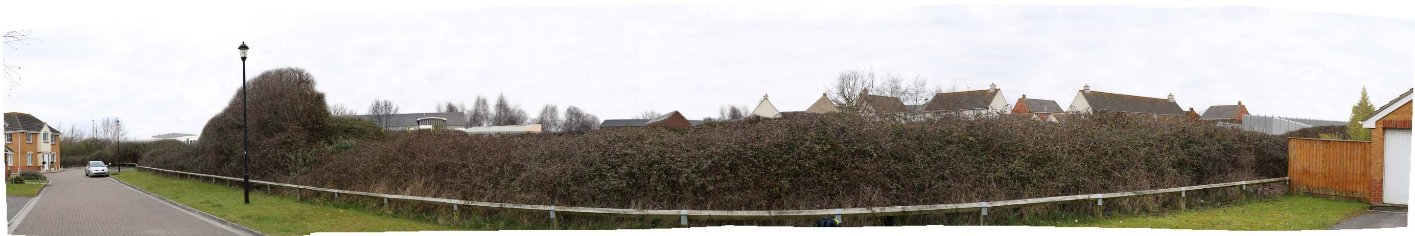
Figure 5: Bridge in grey with screens on both ramps