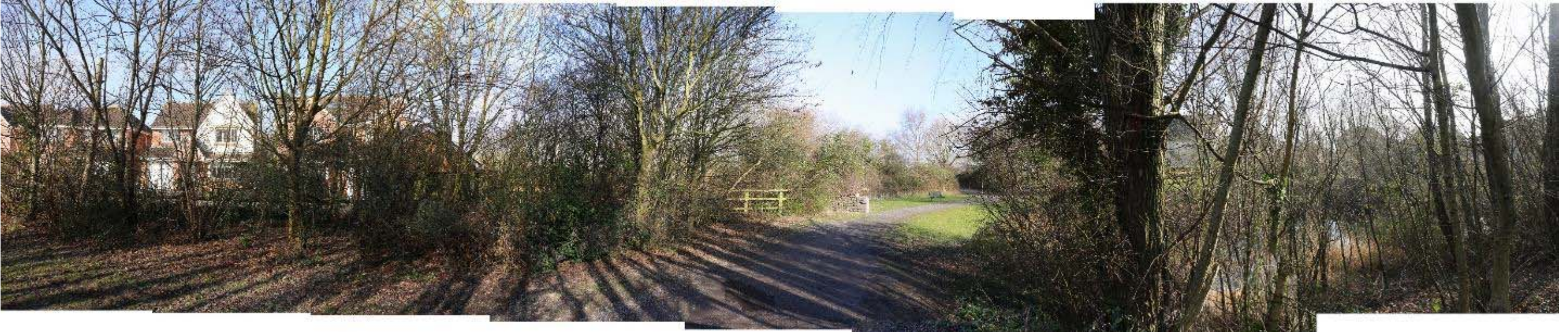
Figure 26: Existing photograph